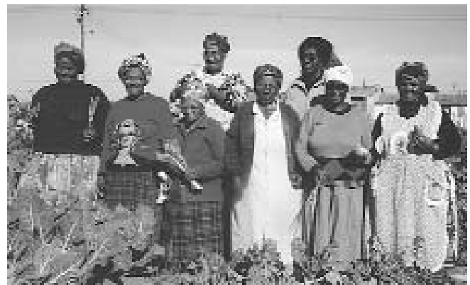
Many of the staff buy vegetables from the gardens