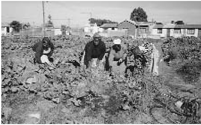
Some of the garden staff at work

which has crisis all the time. My working schedule has been very busy away from Cape Town in remote areas with no electricity and no laptop. Two of us had to go out to deal with conflict for just more than two weeks just before you came back from your vacation with your husband. Then it was report after report and planning for next year, then it was deaths of one of the women mediators you met and two other grown-up children of those women you met—because I work with them, I was pulled to help with so many issues.